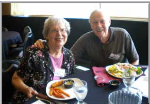
Our luncheons are always tasty with lots of smiling people!

The next Pre-retirement Seminar will be presented in April 2019.